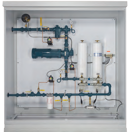
A small cabinet-mounted fuel maintenance system

The first step in fuel oil maintenance is to remove the water and filter out the particulate from the fuel in the storage tanks.